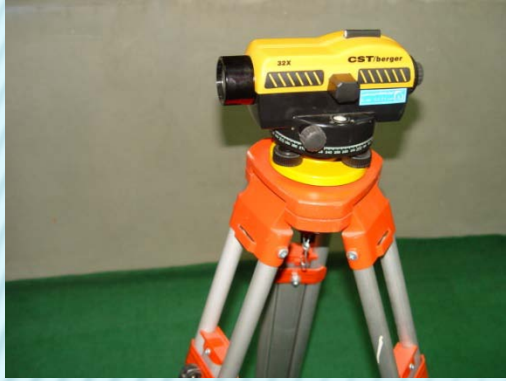
Surveying's Equipments: Nivoo