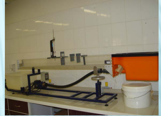
Sediment Transporting Apparatus