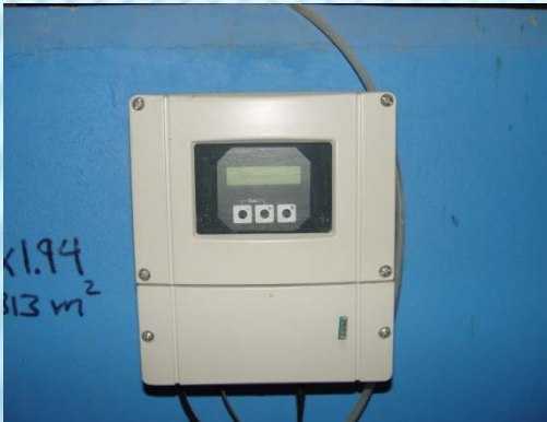
Ultrasonic Flow meter