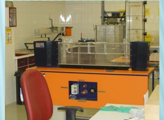
Adjustable Bed Flow Apparatus