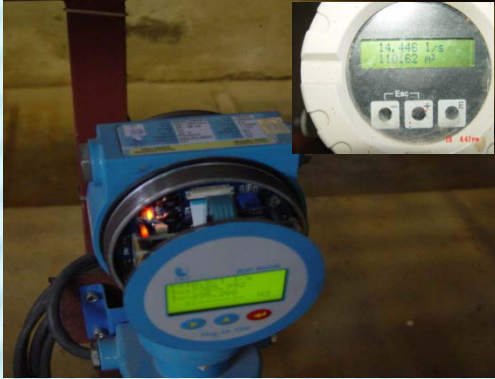
Electromagnetic Flow meter 4"