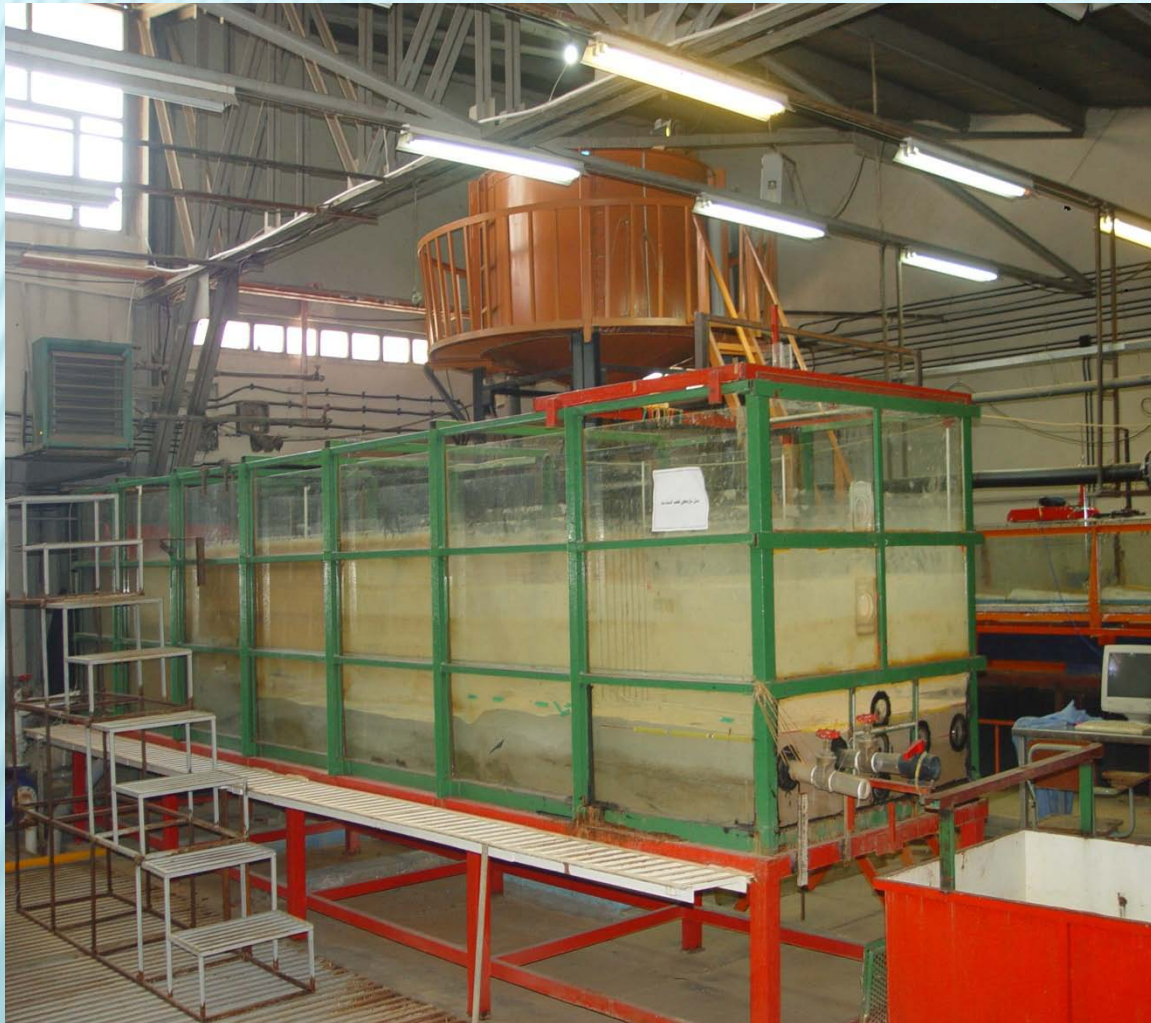
6* 1.5m Flume Open Channel for Reservoir Modeling with Mechanical Sediment Leveler