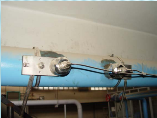
Clamp on Sensors of U-Flow meter On 4" pipe